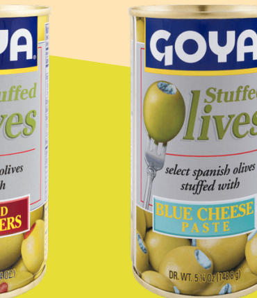
STUFFED OLIVES WITH BLUE CHEESE PASTE