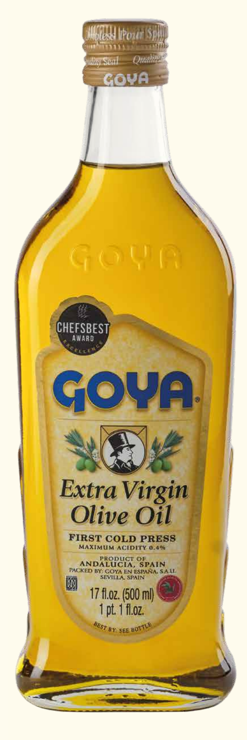
Extra Virgin Olive Oil