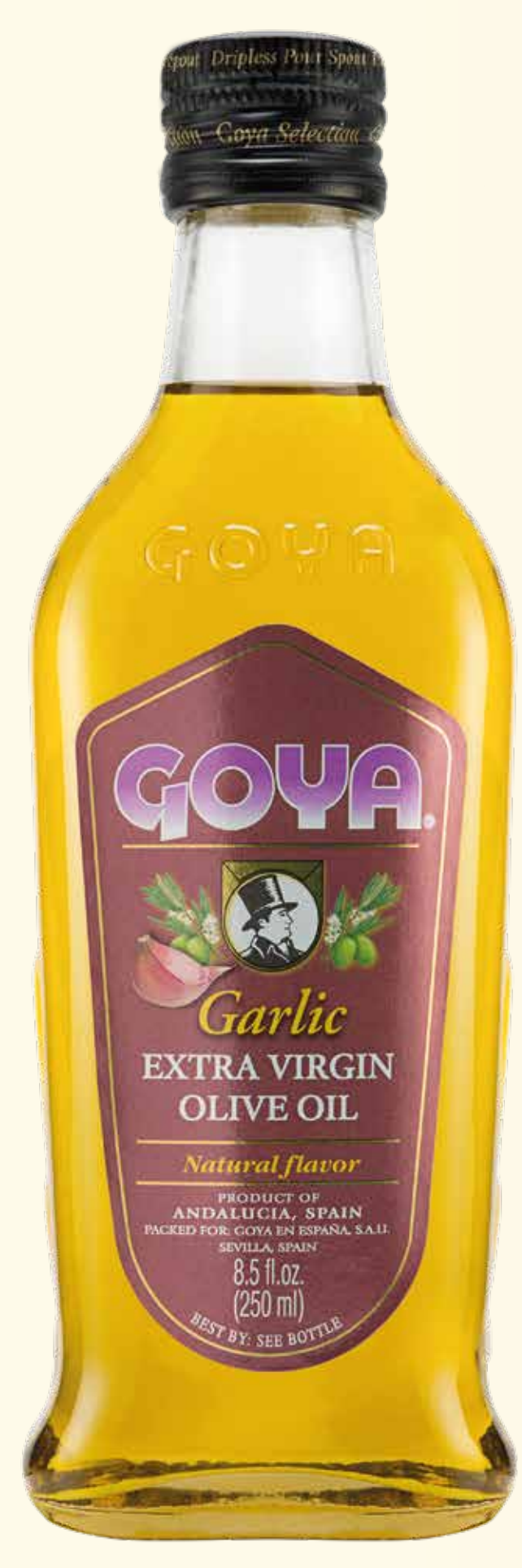
Garlic Extra Virgin Olive Oil