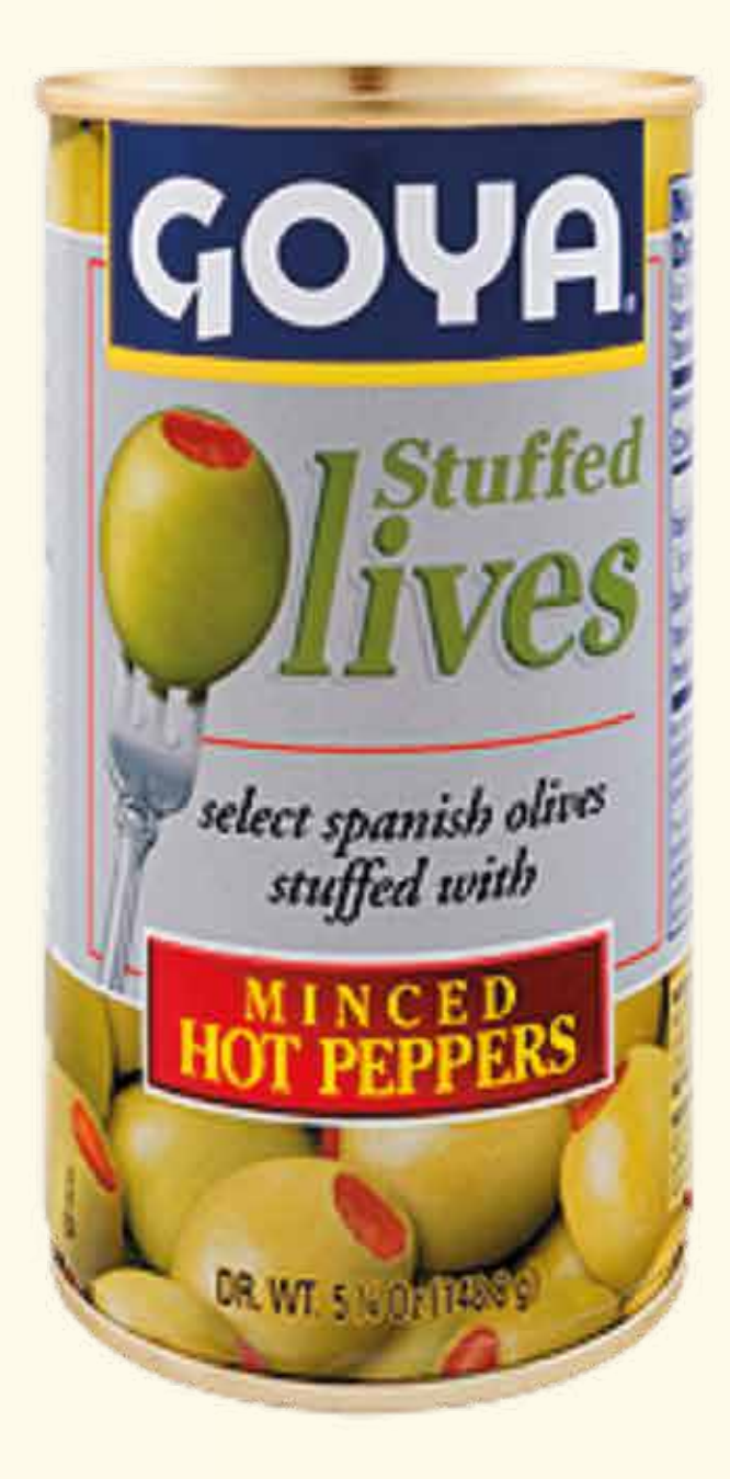
Stuffed olives with Minced Hot Peppers