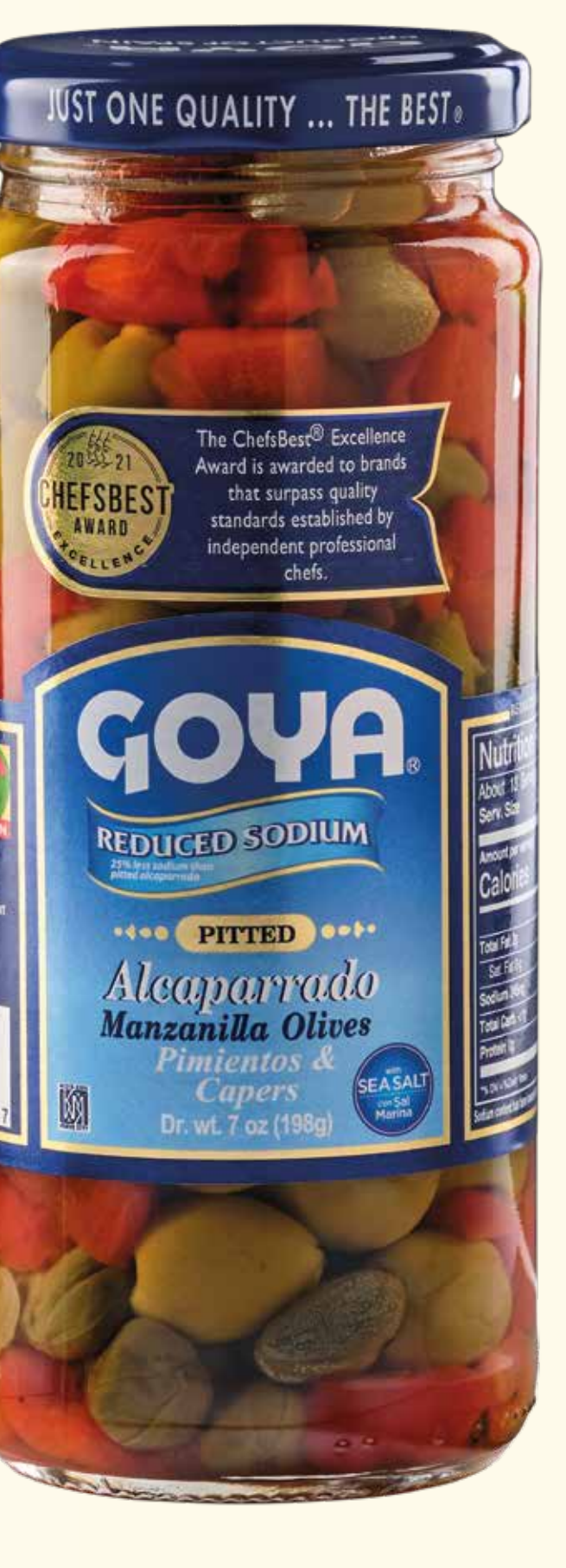
Pimientos and Capers

USDA Organic Certified. The organic, healthiest and most environmentally conscious line developed by Goya Spain.