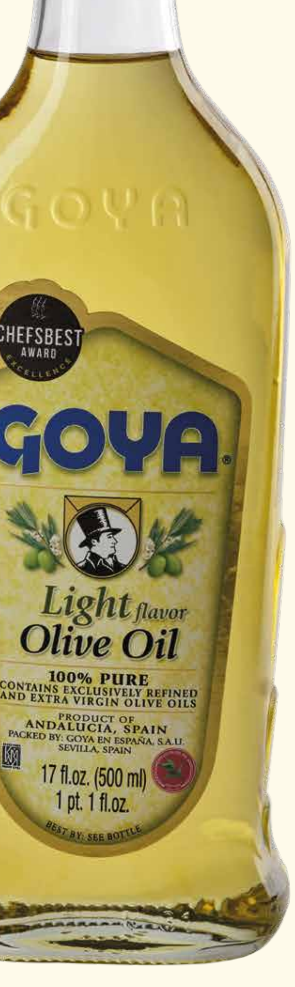
Light Flavor Olive Oil