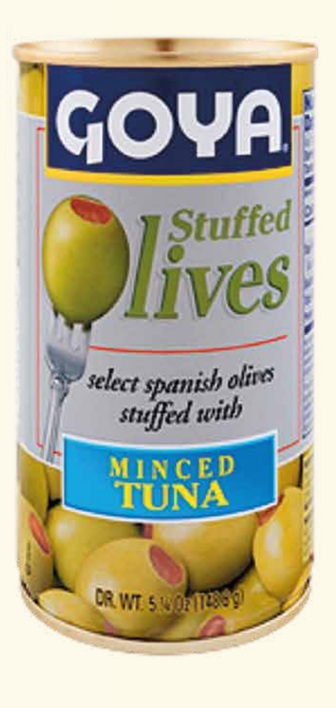
Stuffed Olives with Minced Tuna