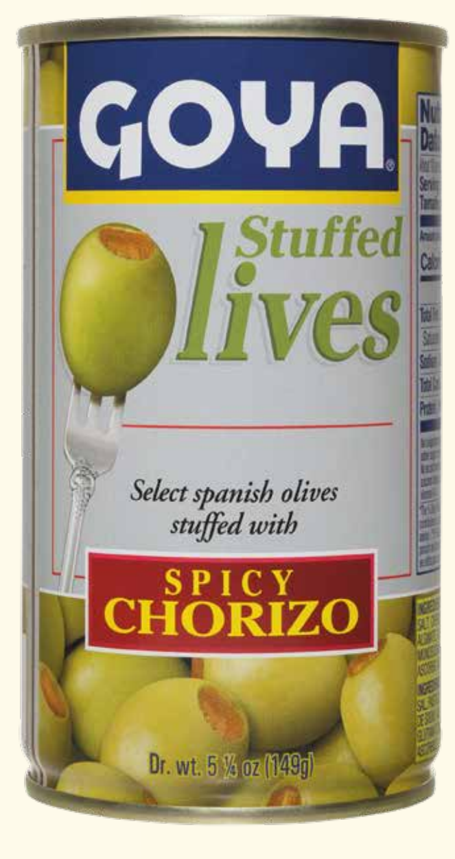
Stuffed Olives with Spicy Chorizo