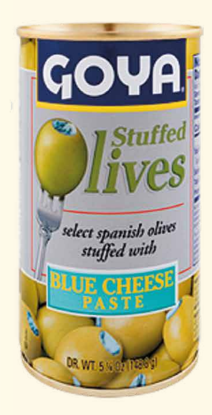
Stuffed Olives with Blue Cheese Paste