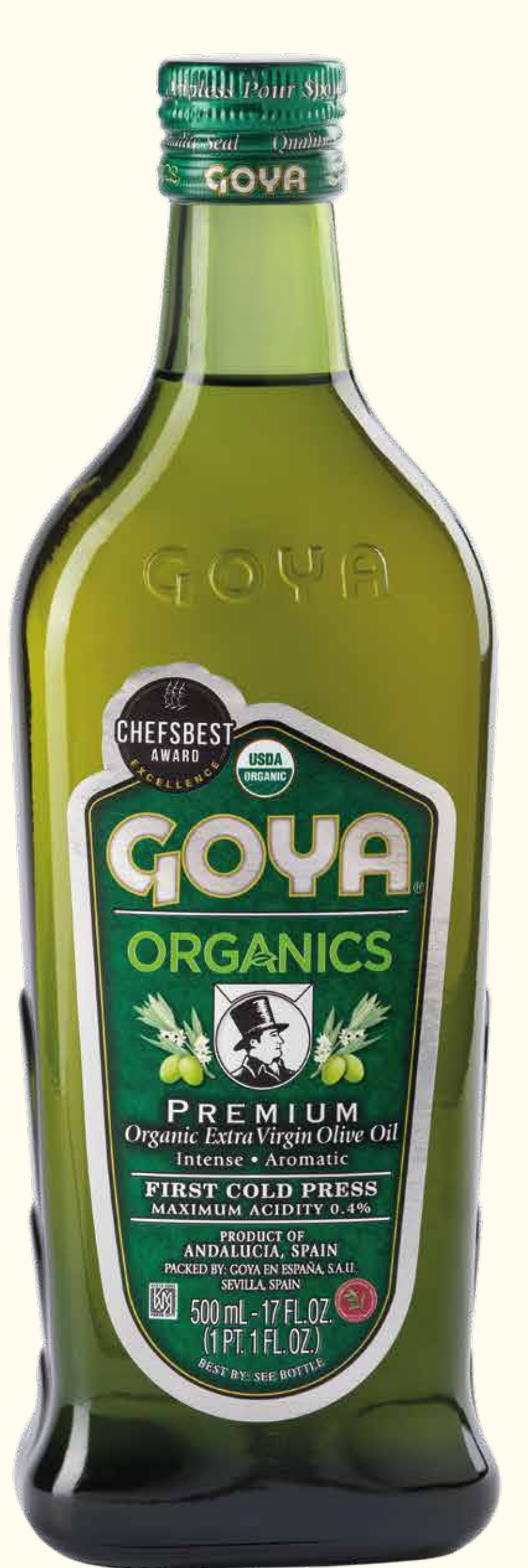
Organics Premium Extra Virgin Olive Oil