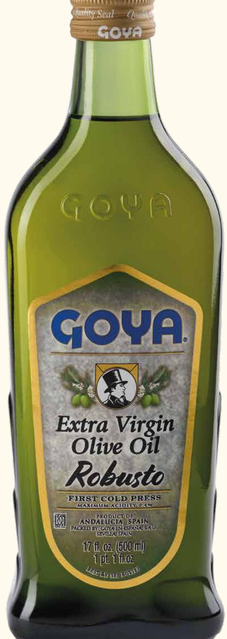
Robusto / Fruity Extra Virgin Olive Oil