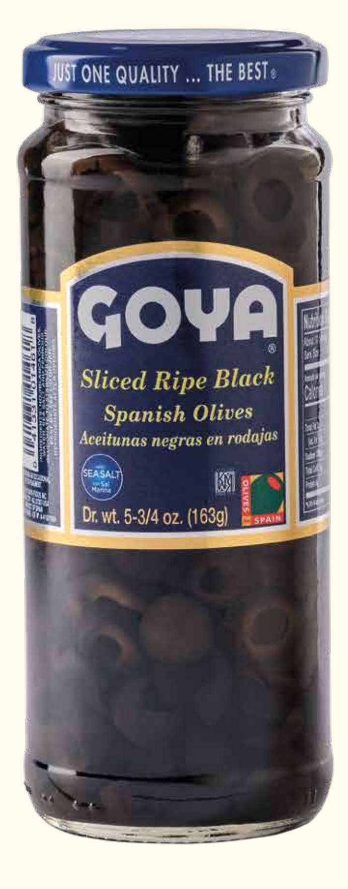
Black Sliced Olives