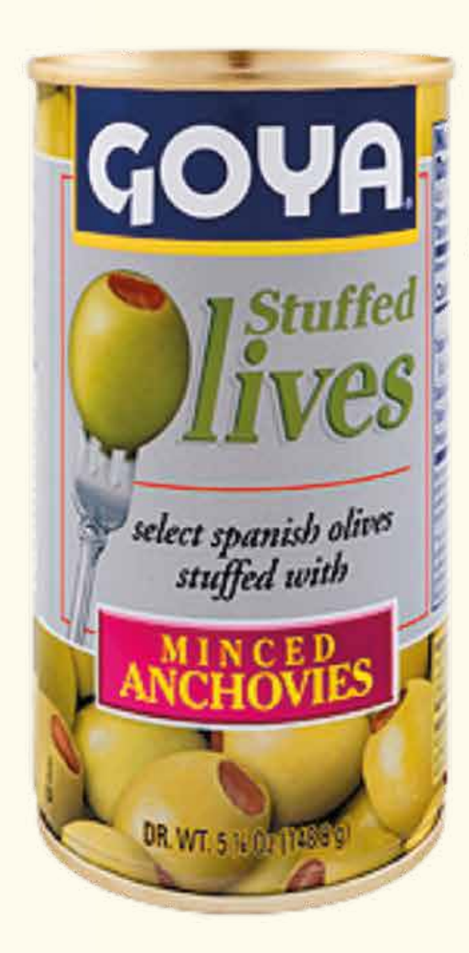
Stuffed Olives with Minced Anchovies