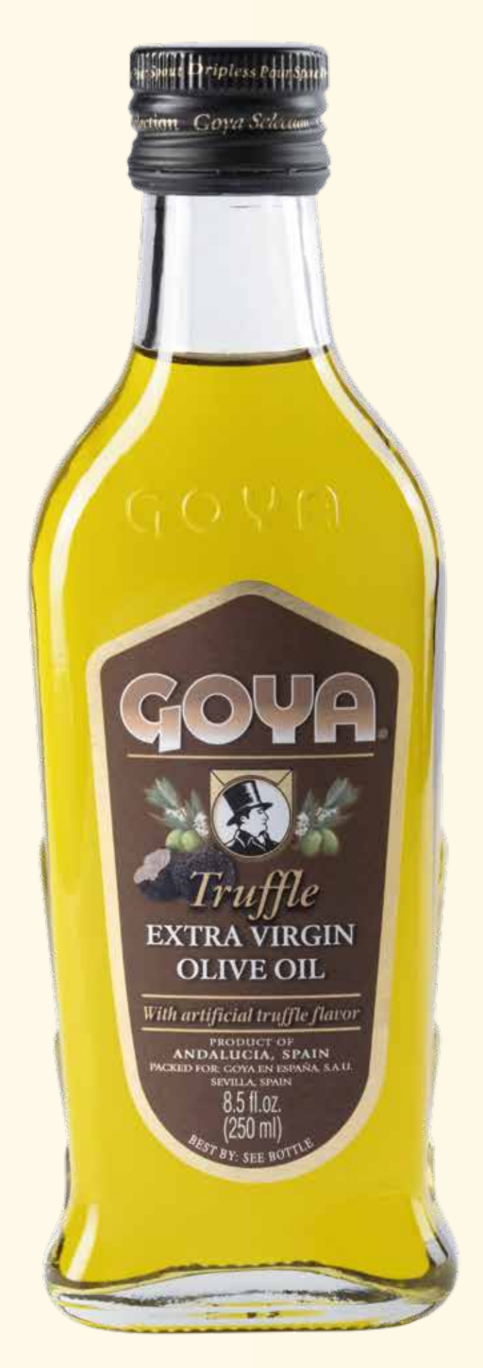
Truffle Extra Virgin Olive Oil