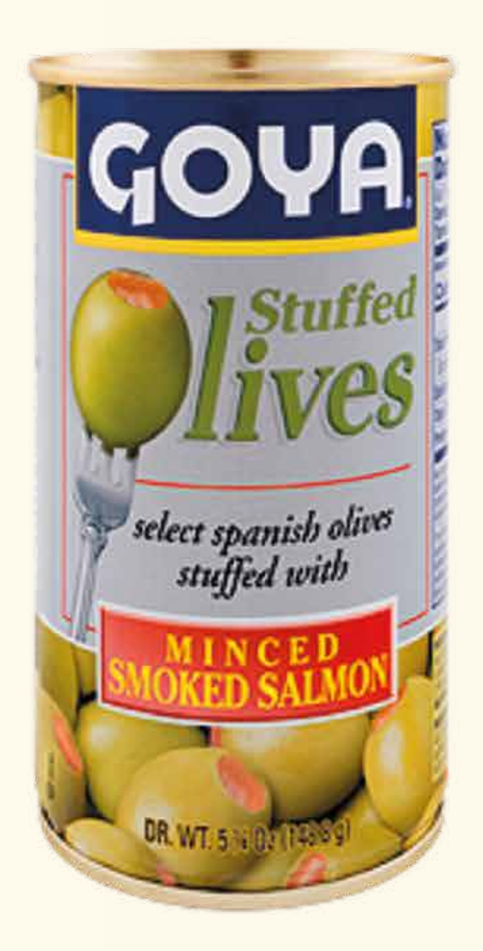
Stuffed Olives with Minced Smoked Salmon